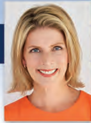
St. Rose Parishioner

For further information, please call the Parish Office.