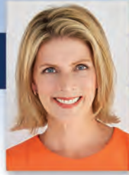
St. Rose Parishioner

Consider Remembering Your Parish in Your Will. For further information, please call the Parish Office.