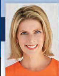
St. Rose Parishioner

For further information, please call the Parish Office.