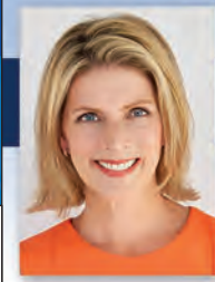
St. Rose Parishioner

For further information, please call the Parish Office.